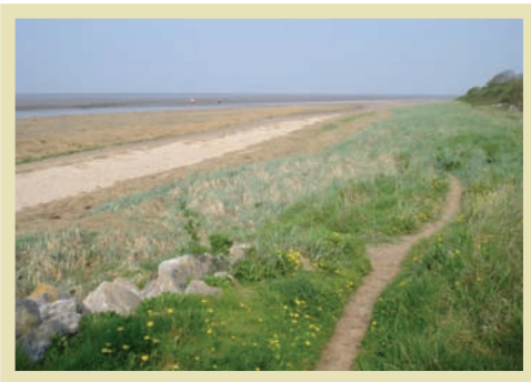
The beach at the end of Target Road.

Buses and Trains: Bus stops are located within Lower Heswall. Heswall Railway Station is just over 2 miles away.