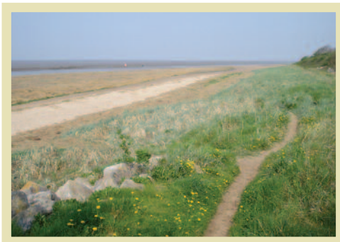
The beach at the end of Target Road.

Buses and Trains: Bus stops are located within Lower Heswall. Heswall Railway Station is just over 2 miles away.